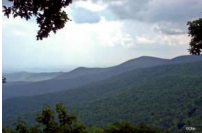
Appalachian Trail

The world-famous Appalachian Trail (AT) begins at Springer Mountain in Georgia and winds its way for 2,150 miles to Mount Katahdin in Maine. The Georgia portion of the trail extends for 75.6 miles generally in a northeasterly direction, from Springer Mountain to Bly Gap on the North Carolina border. The Georgia portion lies entirely within the Chattahoochee National Forest.