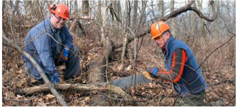
Members of the GATC help keep the AT clear of debris.

The GATC not only keeps the AT clear and marked but also tries to keep it from being loved to death. The popularity of the AT is wearing it out. Most maintenance trips are spent rehabilitating the AT—trying to repair and reassess the effects of so many feet. Blood Mountain, the highest point on the AT in Georgia, is the most heavily used section of the AT in the Southeast. The GATC spends many Saturdays on the mountain, installing water diversions and stone or log steps, narrowing the trail and trying to harden it, and sometimes rerouting portions of the trail to more suitable locations. This same sort of repair work is done on the popular southern terminus, Springer Mountain, as well as many other well-trodden trail sections and campsites. Techniques for dealing with worn out trail are constantly being developed by the ATC and its volunteers.